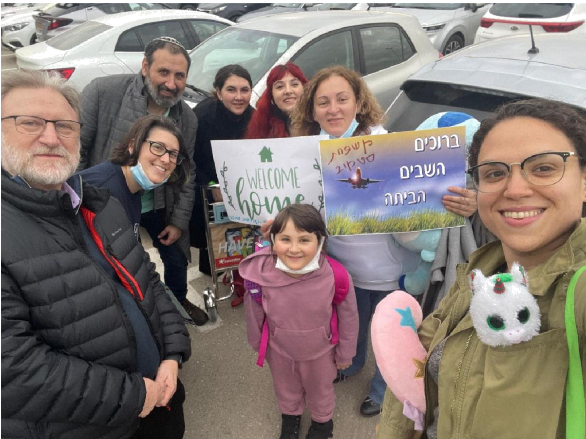
The Stamov family arrive in Israel where they were greeted by representatives from Masorti Olami and The Schechter Institutes