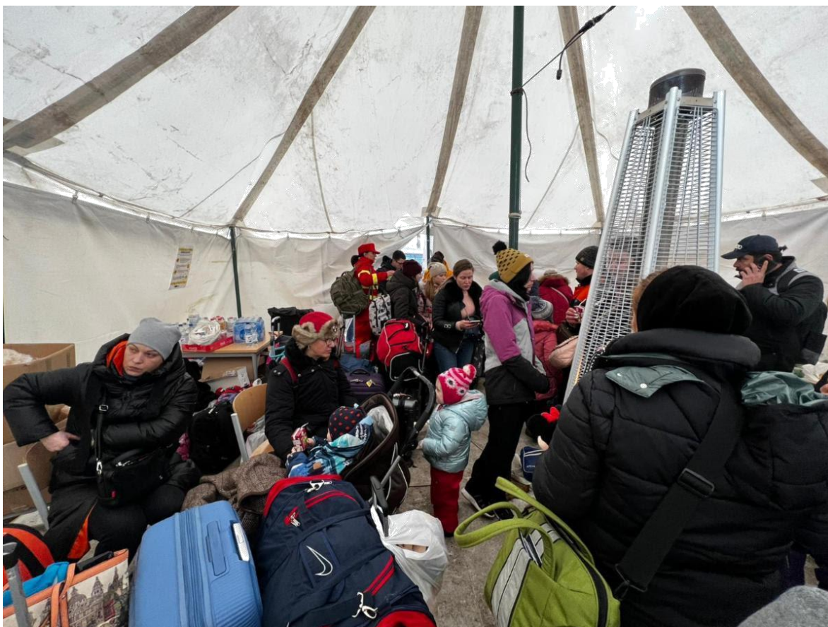
The group from Chernivtsi after crossing the border into Romania