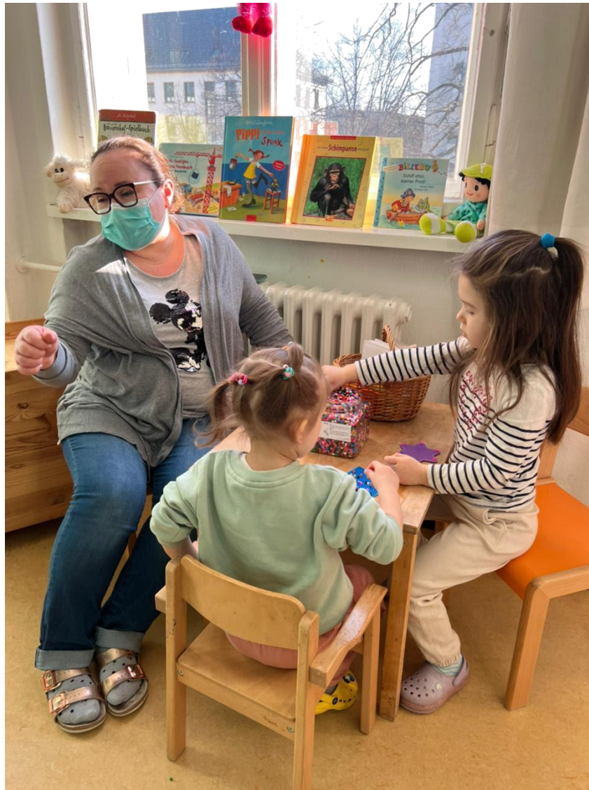
Ukrainian refugee children from our communities begin their first day of "gan" (kindergarten) at the Masorti Elementary school in Berlin

Our communities in Poland and Prague are still working very hard with the refugees that are with them, on helping them get to their next destination. We again want to thank all of our communities around Europe who have offered to assist and welcome refugees and are supporting our ongoing efforts. Along with The Schechter Institutes , we continue to support our communities still within Ukraine by evacuating them to safety, as well as with individual families and refugees who have fled the country and are in need of our assistance.