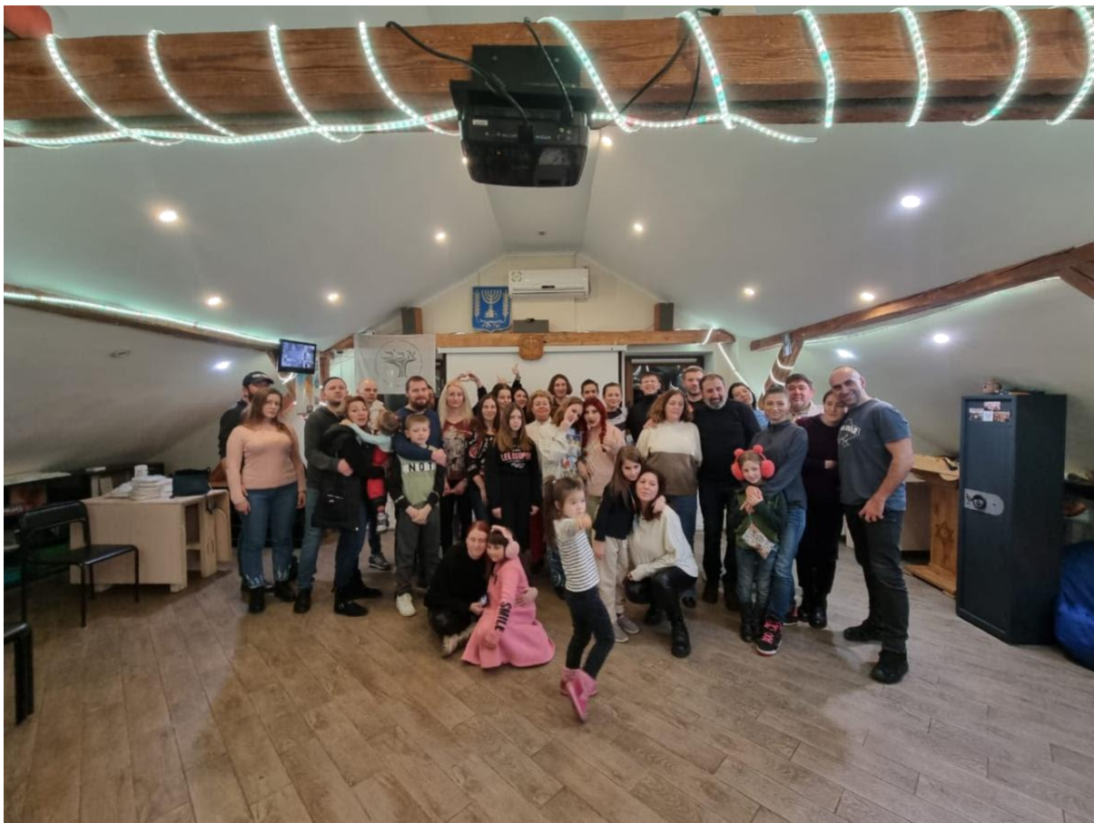
Community members in Chernivtsi after their last Havdallah together before evacuating Ukraine